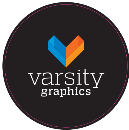
Example 1. Basic shape vinyl stickers. Circles, squares, rectangles etc.

Setting up your vinyl stickers correctly for print